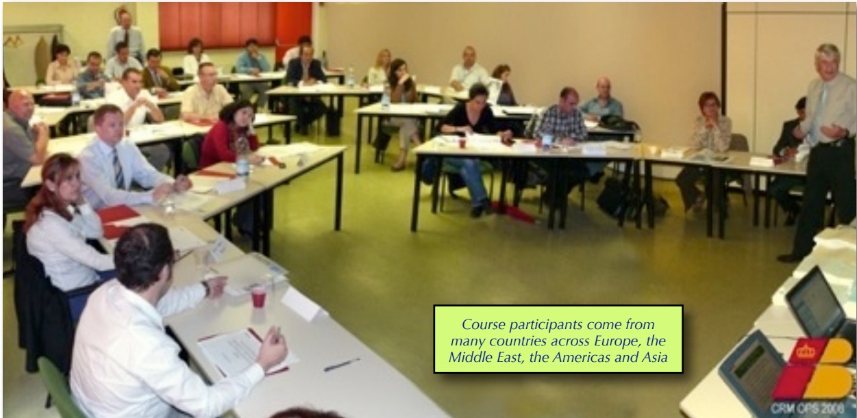
Course participants come from many countries across Europe, the Middle East, the Americas and Asia