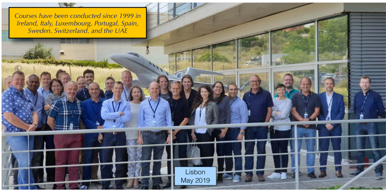
Lisbon May 2019

Courses have been conducted since 1999 in Ireland, Italy, Luxembourg, Portugal, Spain, Sweden, Switzerland, and the UAE