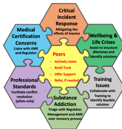
Diagram 2: The different dimensions of peer support

Diagram 2 focuses on the Peer Support piece of Diagram 1, elaborating on its different elements and core topics.