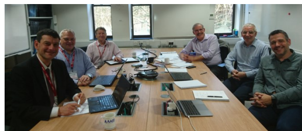
Meeting of the ESASI Committee on 15 January 2020

On 15 January 2020, the committee met at the AAIB premises in Farnborough to discuss a number of issues including an update of the ESASI legal position. After considering several options, it was decided that the best legal basis for an entity like ESASI was a Charitable Incorporated Organisation (CIO), registered with the UK Charity Commission. The advantage of this approach is that there is no tax or personal financial liability.